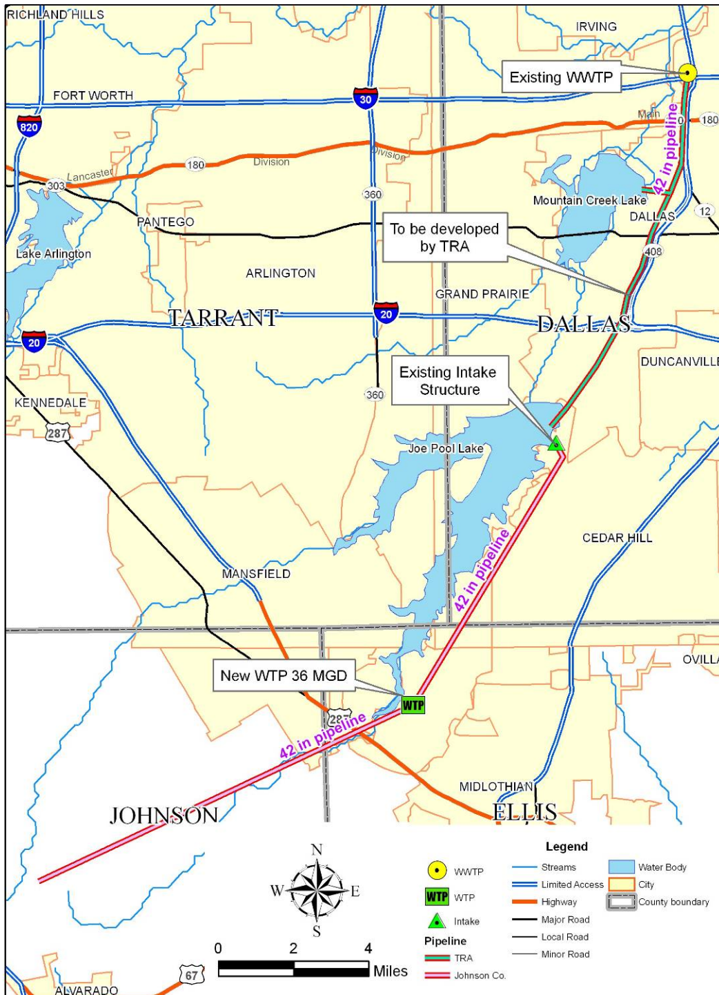
Figure 4B.11-1. TRA Reuse Project to Johnson County SUD